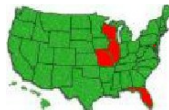
Ten Meter Net Coverages