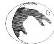
The Cow Jumping over the Moon.

http://www.astroleague.org/al/obsclubs/lunar/lunar3.html