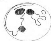
The Man in the Moon.