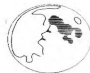
The Woman in the Moon.