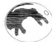
The Rabbit in the Moon.