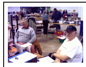
W3VRD and W3JEH minding the store at the BARC Minifest

The event runs from 3 p.m. to 9 p.m. and admission is free.