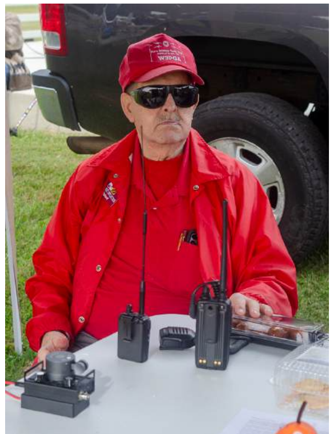
KB3VAE Monitors the Radios