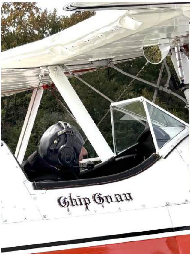
K3DON Takes Flight!