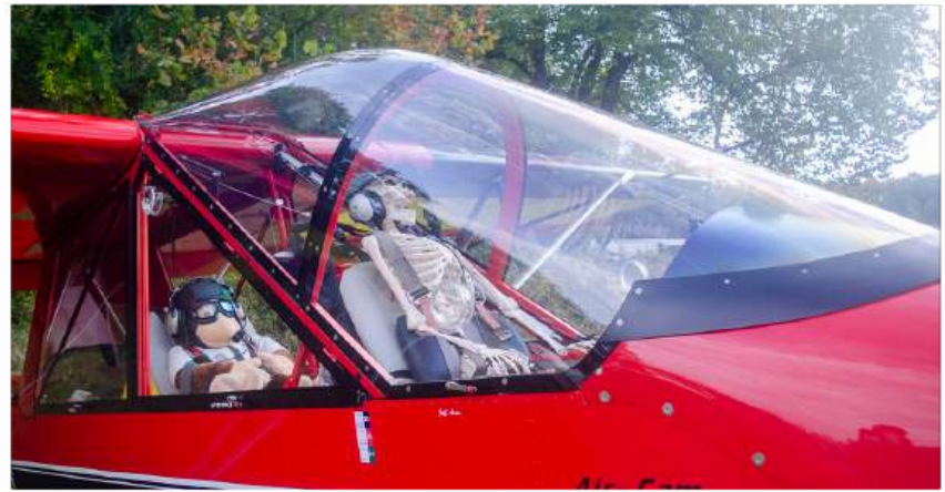
Halloween Pilot at Wings and Wheels